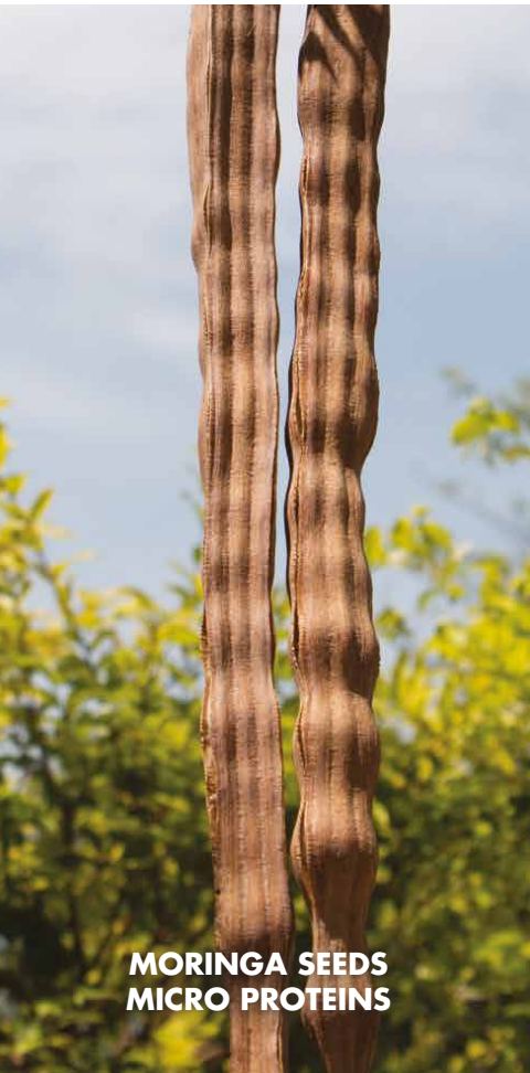
MORINGA SEEDS MICRO PROTEINS

Erydrate: a natural sugar containing an extraordinary moisturizing power with a low molecular weight blends easily with the hair fiber providing a natural "silky feel". Defends from flaking and prevents frizz.